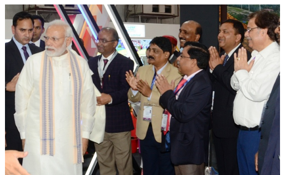
Shimla: 9th Vibrant Gujarat 2019 was inaugurated by Prime Minister of India, Shri Narendra Modi today.